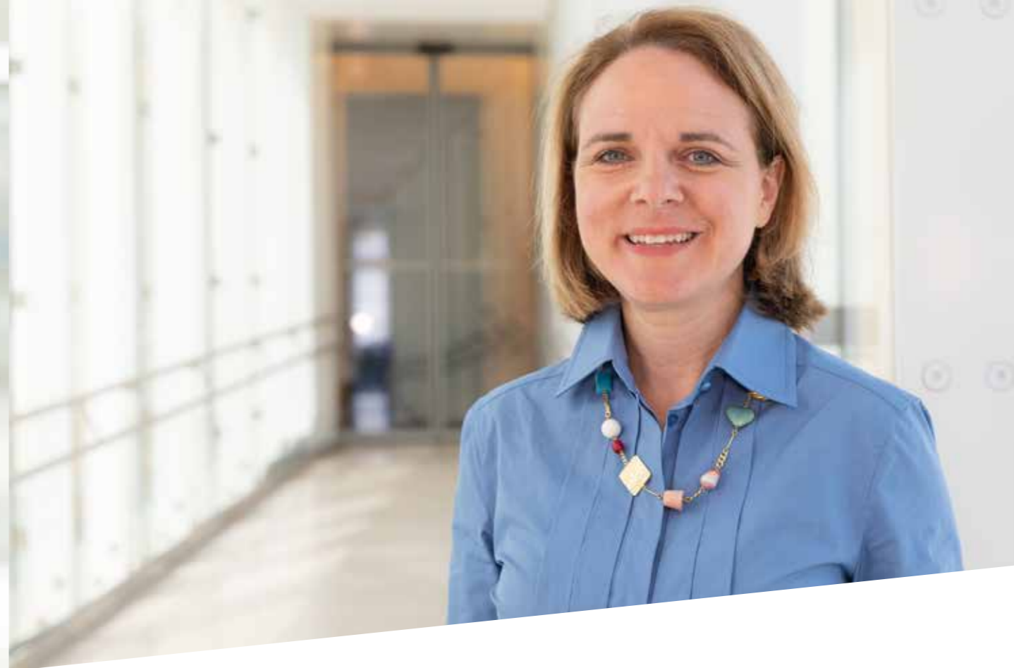
Lydie Polfer Mayor

Everyone wants to age in good health. We all make plans for the future, whatever our age and, as City of Luxembourg officials, one of our top priorities is to provide our fellow citizens with the means to see them materialise, for instance by providing suitable living conditions.