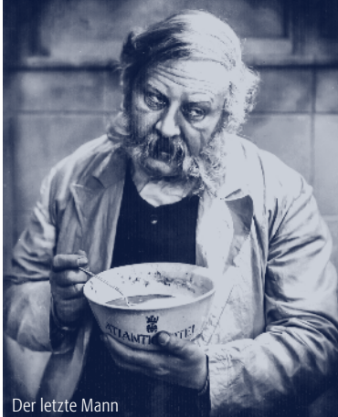
Der letzte Mann