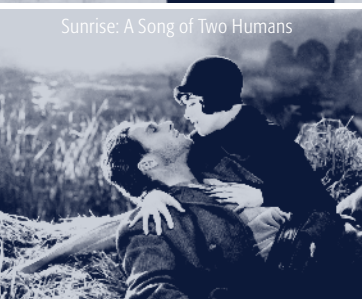
Sunrise: A Song of Two Humans